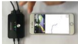
INNOVV K2 GPS Tutorial for iOS Device